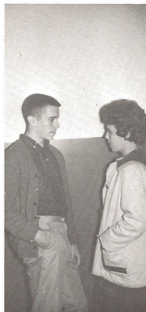
Teachers gather informally for a mid-morning break.