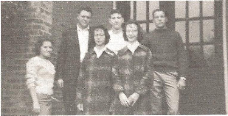
"I'm like ya!"