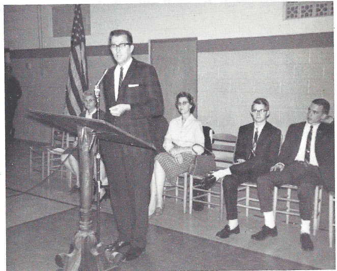
A lecture to the student body