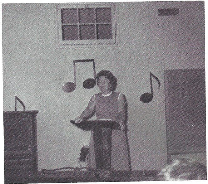
"One, two, three, sing!!!"