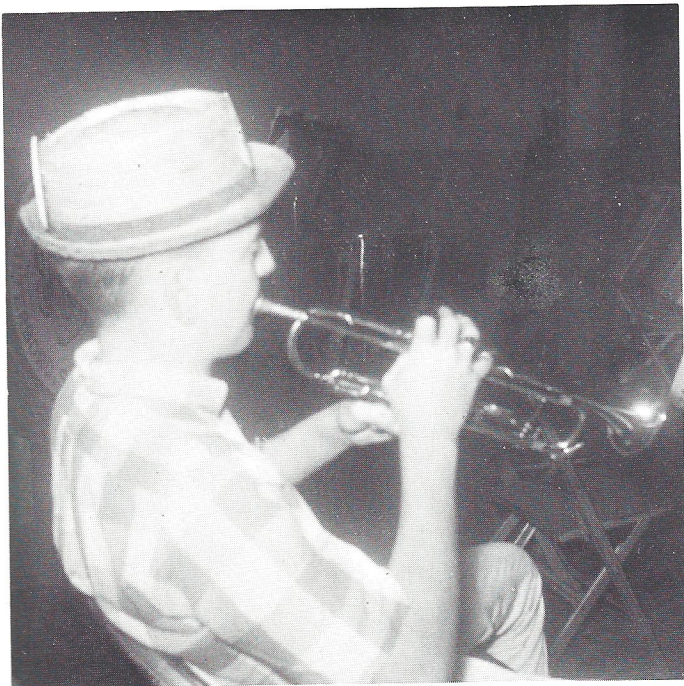
"Come, blow your horn!"

The music department manifests itself vocally in various forms, including the mixed chorus, boys' double quartette, boys' glee club, girls' triple sextette, and girls' glee club. This year it had three members of the chorus selected for the All-State Chorus and six for the Clinic Chorus.