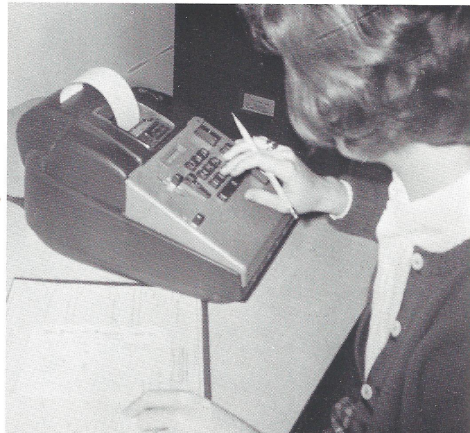
"It just won't balance!"