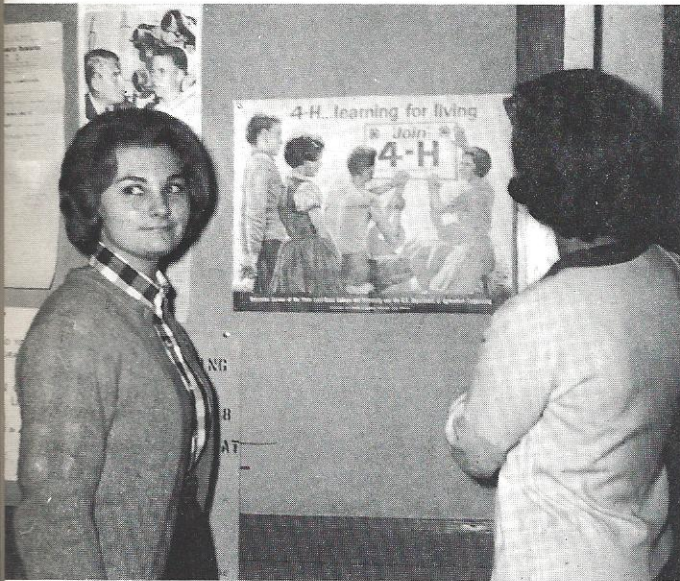
Posters encourage others to join 4-H.