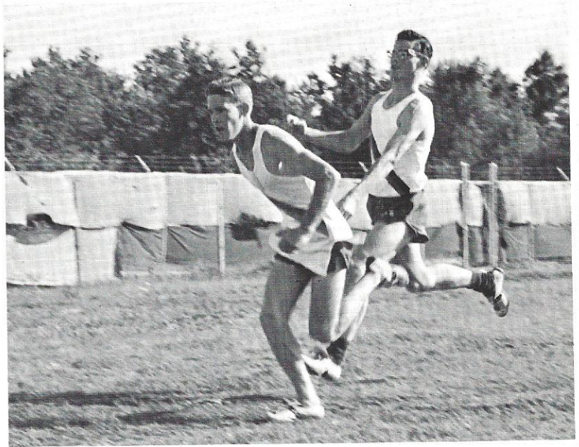
Be careful! Don't drop it!"