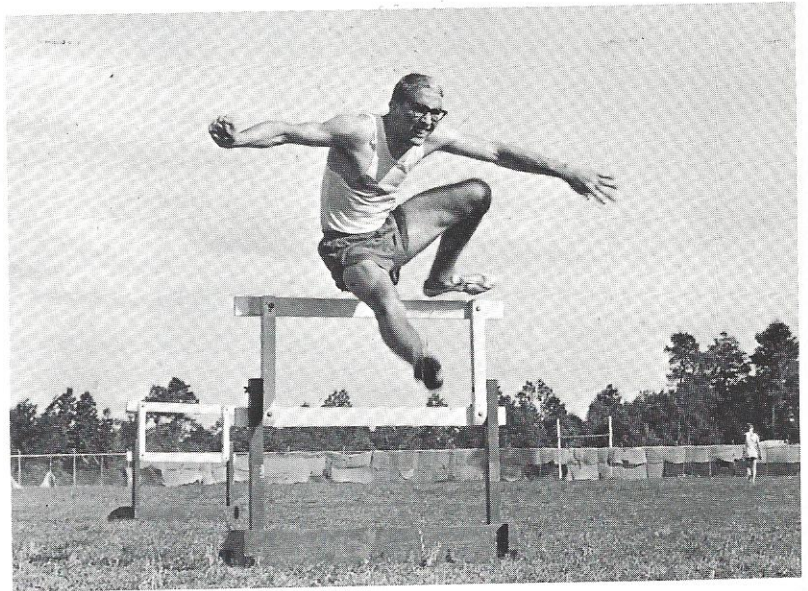
"It sure would be easier to run if somebody hadn't left his hurdles in the way!"