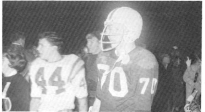
Lost the touchdown, but won the game.