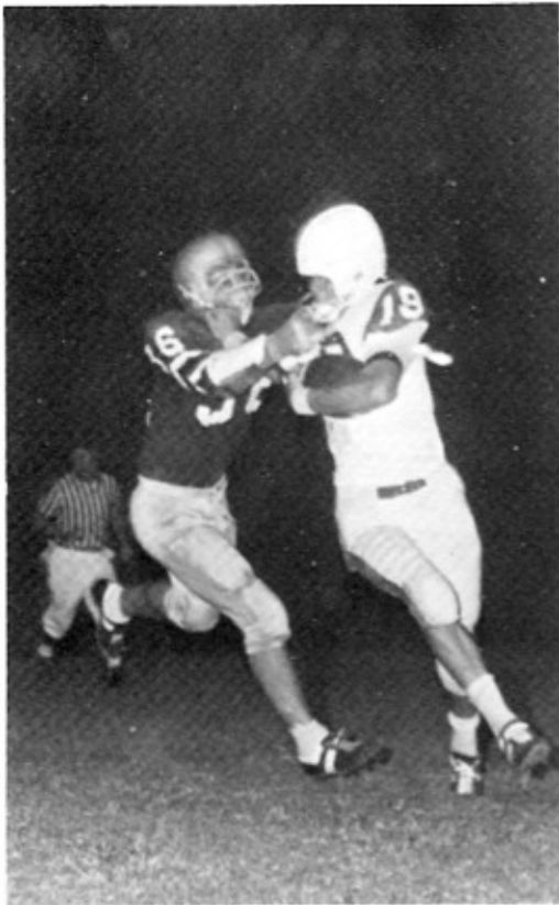
May I have this dance ?