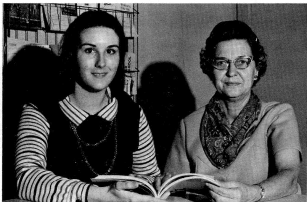
STAR Student and Teacher