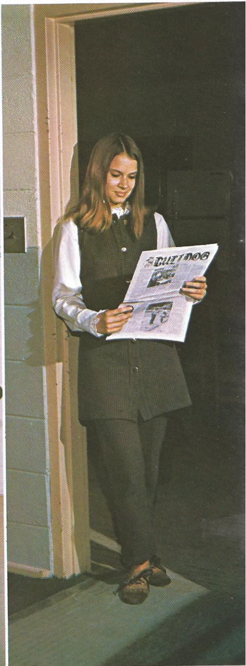
ORGANIZATIONS PAGE 48