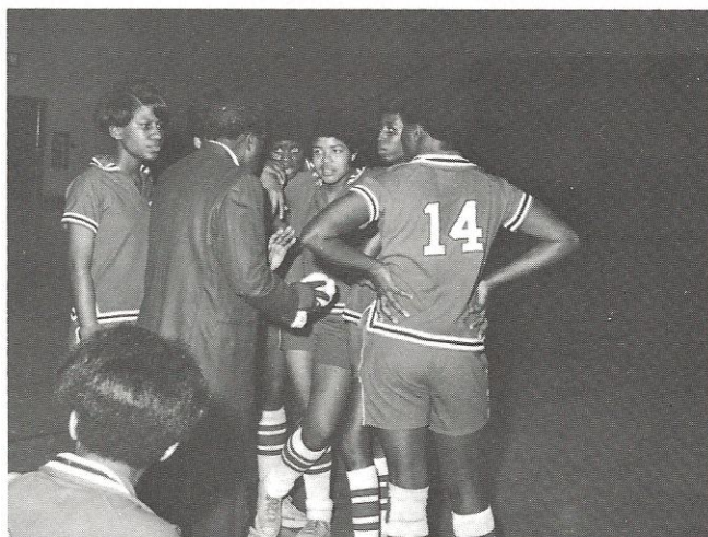
Tell 'em, Coach.