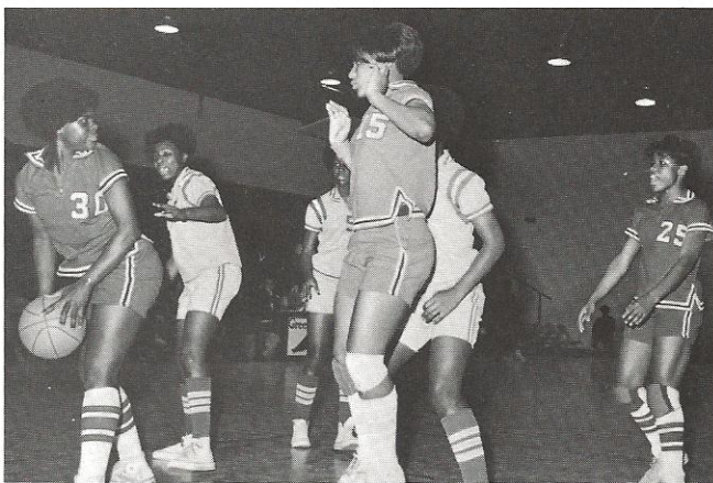
Come on — Get Involved.