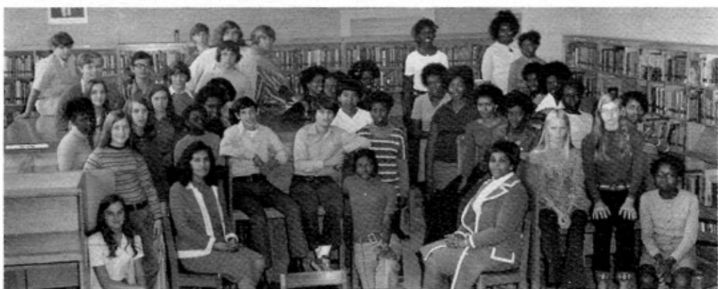
1/ Student Council