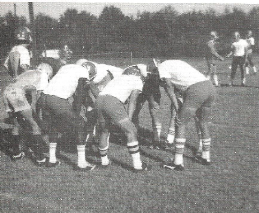
The Bulldogs start off their 73-74 season in shorts, shoes and helmets.

The Bulldogs started their season with back-to-back triumphs over Beaufort and Burke.