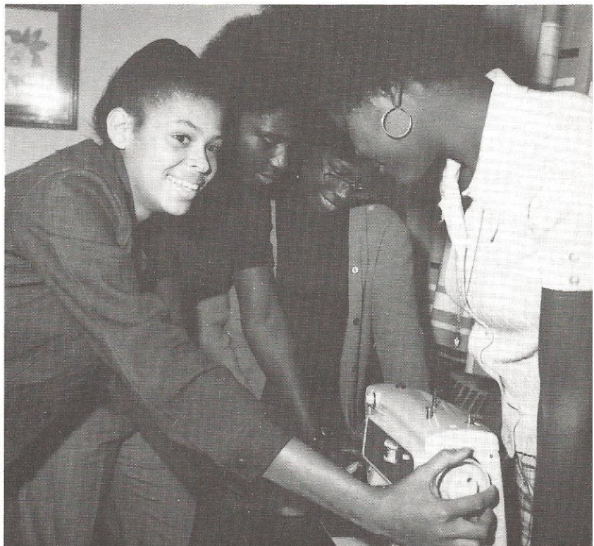
(Above) FHA members experiment with a sewing machine. (Far left) D.E. participant presents a commercial demonstration. (Left) Another participant in D.E. goes over his speech.

FFA and T&I supplement classroom instruction in agriculture, forestry, drafting, and shop. In club meetings, students went beyond classroom experiences in exploring vocations in these fields.