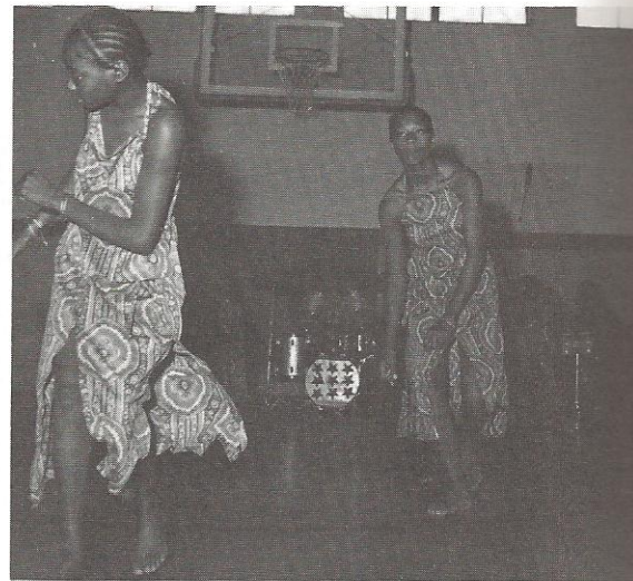
The Uhuru Motto dancers entertain the audience.

The Debating Club was organized to help students develop skills in speaking and reasoning. The students first gathered information and then organized it. When all the information available was learned, the students chose opposing sides. They then debated the matter and saw who had the best argument either for or against the subject.