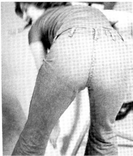
"I wanted you to take my picture, but this isn't what I had in mind!"

Back in our high school days we really did some crazy things. Remember the games and pep rallys, the leg contests, all the excitement yet there was always a quiet moment or two. It is bad to think that it is coming to an end. Only two years at Walterboro High School and then graduation. Ten, twenty, fifty years from now we'll look back and remember all the crazy things we use to do.