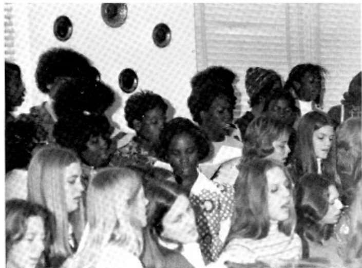
Girls chorus practice for the upcoming Christmas Concert.