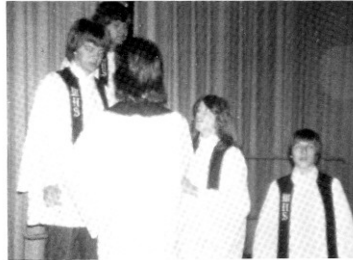
Chorus members chat behind the curtain anticipating the opening number.