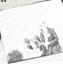
M C G