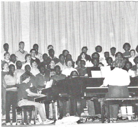
Tying up loose ends at dress rehearsal at the auditorium is the performing chorus.