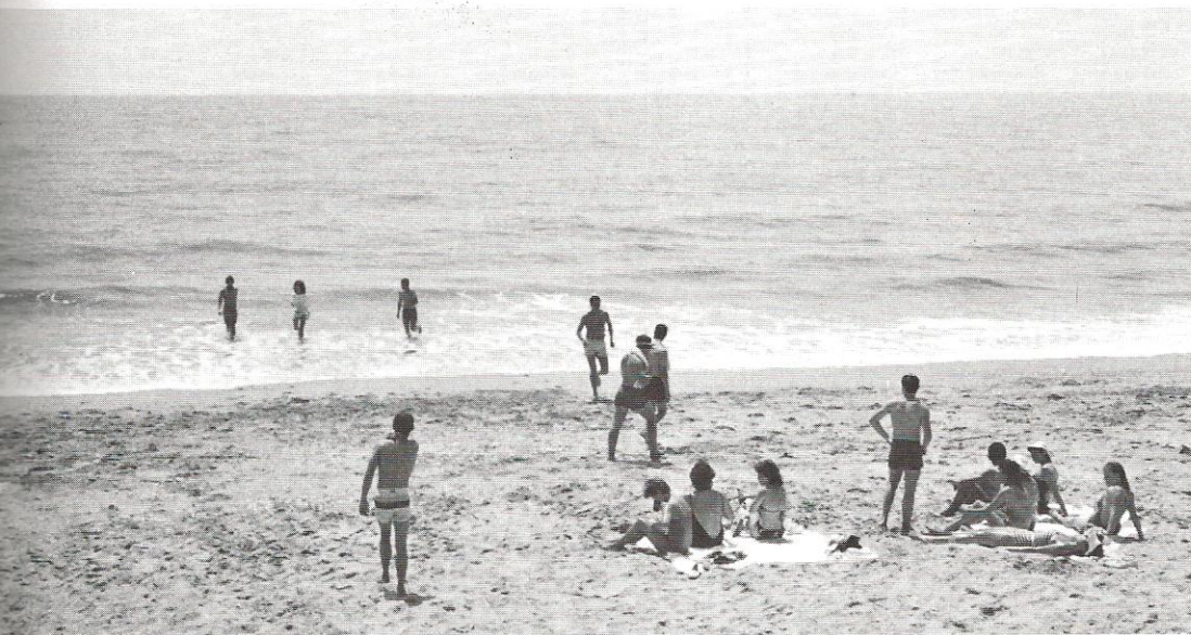
Swimming and lying in the sun are the main recreations at Edisto Beach.