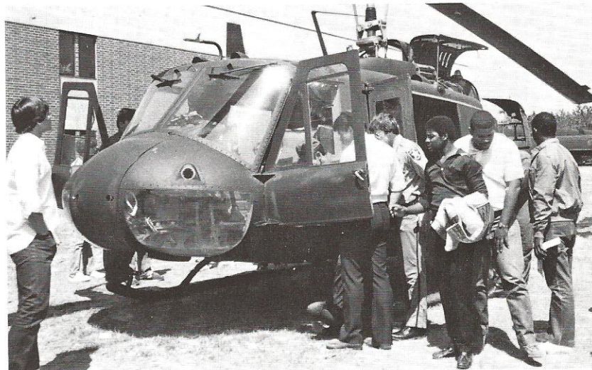
Enjoying the Army helicopter display, students move closer for a better look.