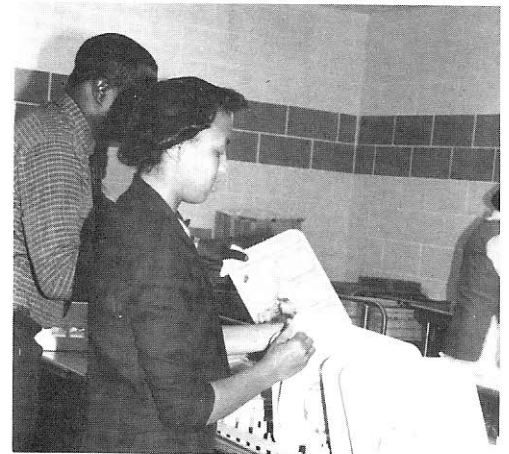
Visiting the trough is a dirty job—but somebody has to do it.