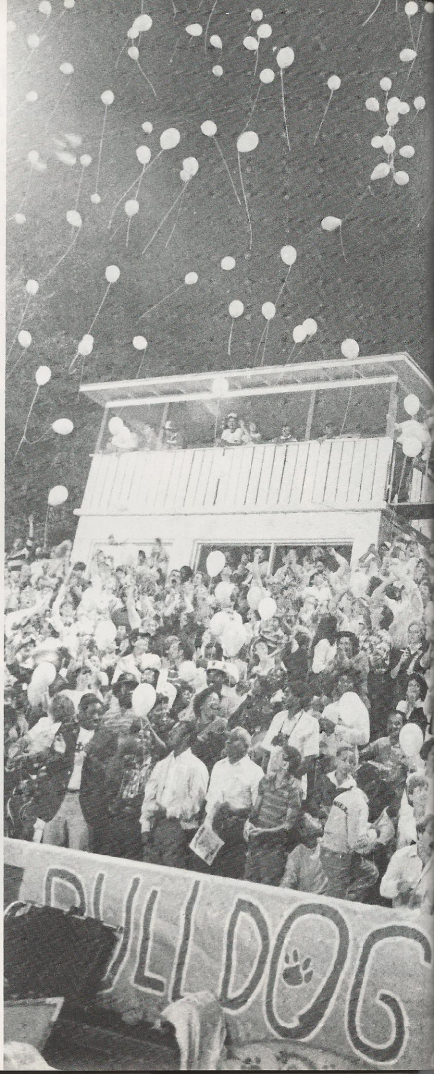
Balloons and signs were just a small, but important part of the Spirit Club.