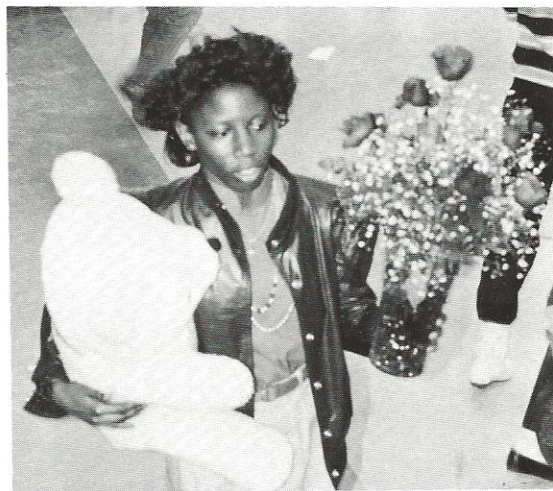
Helping to distribute the flowers in the main office is George Washington.