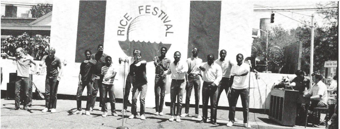
The boys' chorus performs on Main Street at the Rice Festival.

Though the weekend didn't last as long as many wanted, it was enjoyed. The Rice Festival Board of Directors anticipate an even better festival and a larger crowd next year.