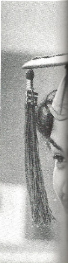
Friends are a nice and necessary part of graduation preparation.