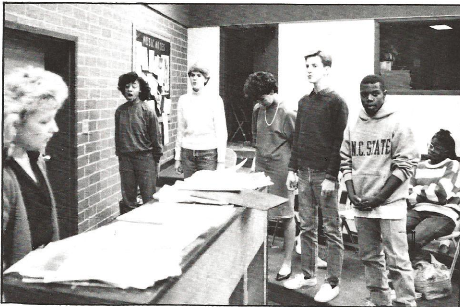
Chorus members sold donuts in order to rejuvenate their sagging bank account. The money raised went toward music and concert expenses.