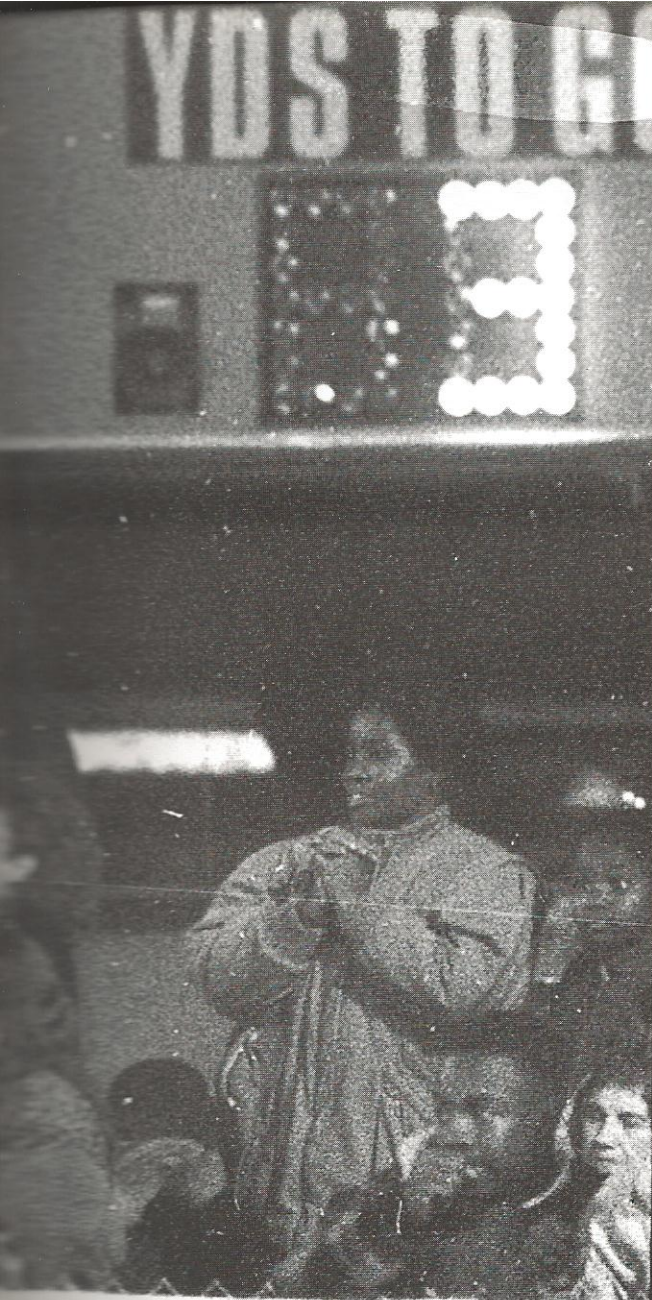
Friday nights during the fall are always busy as many fans head to Bull-dog stadium to cheer on the team. Fans stand behind the banner at the Lower Richland game.