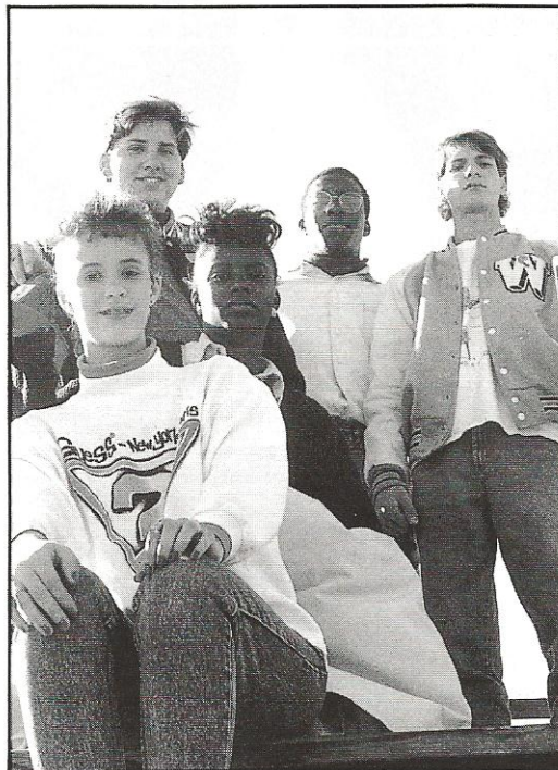
Sophomore Class officers take a break from their duties to get a breath of fresh air in the student parking lot.