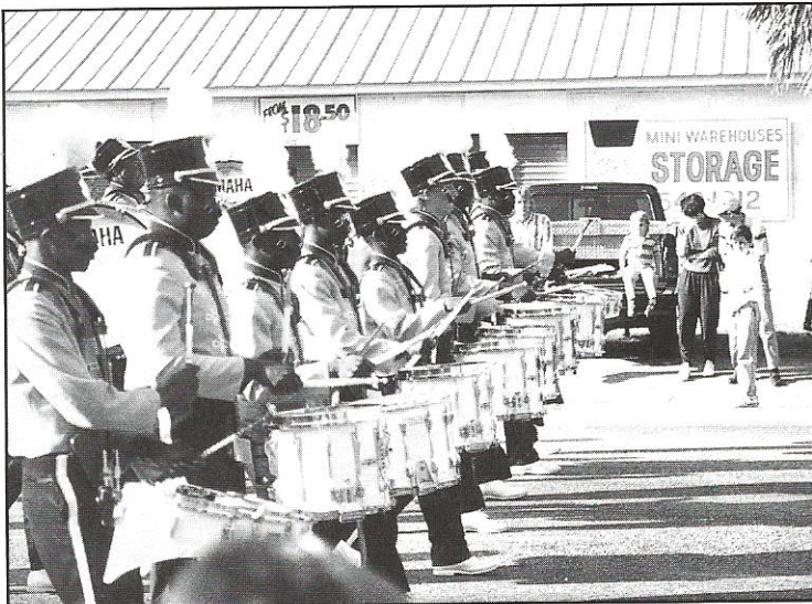
The Band of Blue performs at the Waltherboro Christmas parade. The band won first place in state for its on field formation marching.