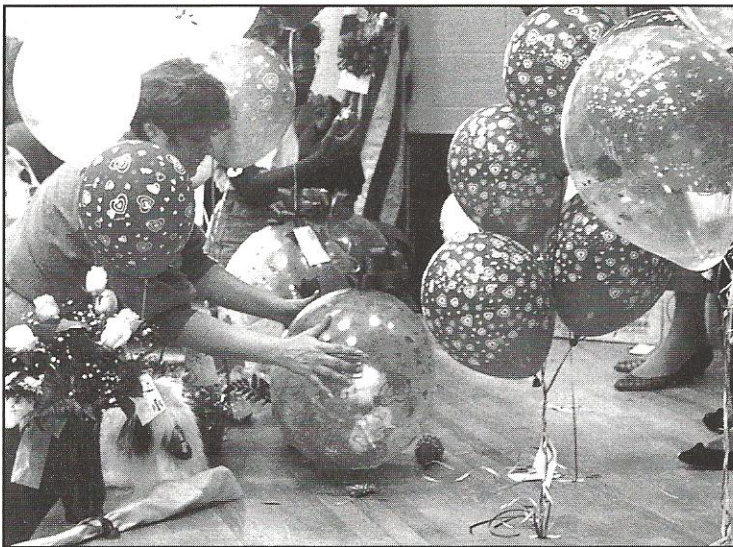
A local florist delivers balloons to the high school. Florist delivered over 400 items to the high school.