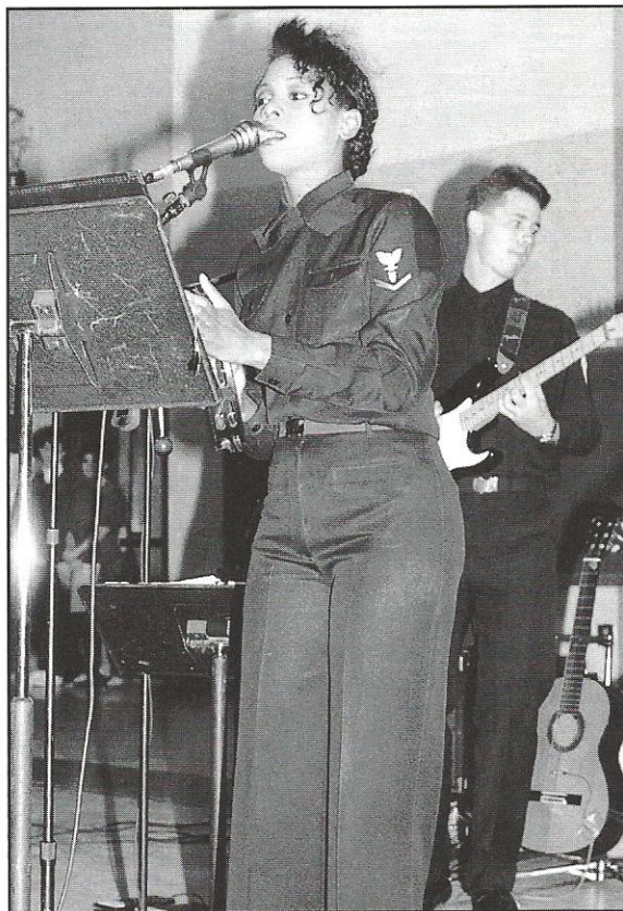
A member of the Navy Band performs at an assembly. The band played contemporary music.