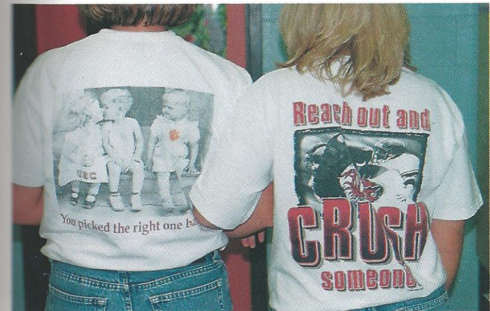
Back that thing up! Students participated on college day by wearing their favorite college shirts, outfits, and other attire. These girls wore Clemson and Carolina shirts, two of the biggest rivals in the state!