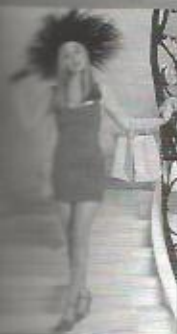
As if! Clueless stars, Alicia Silverstone and Stacey Dash made being a ditz cool for thousands of teenage girls in the 90's.