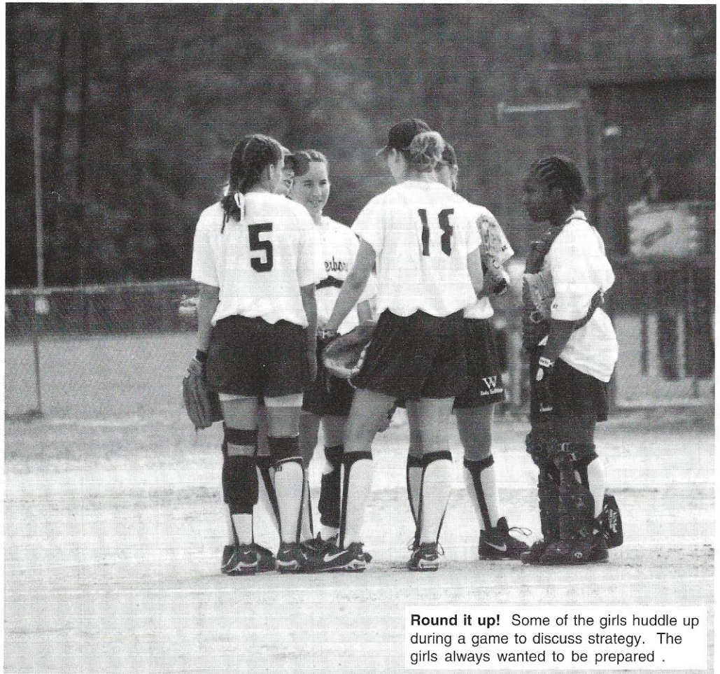
Round it up! Some of the girls huddle up during a game to discuss strategy. The girls always wanted to be prepared.