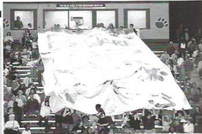
Need a little help from our fans. WHS cheerleaders spent an extra two hours making this enormous sign. The effort paid off and the football fans had an opportunity to participate in the pre-game excitement.