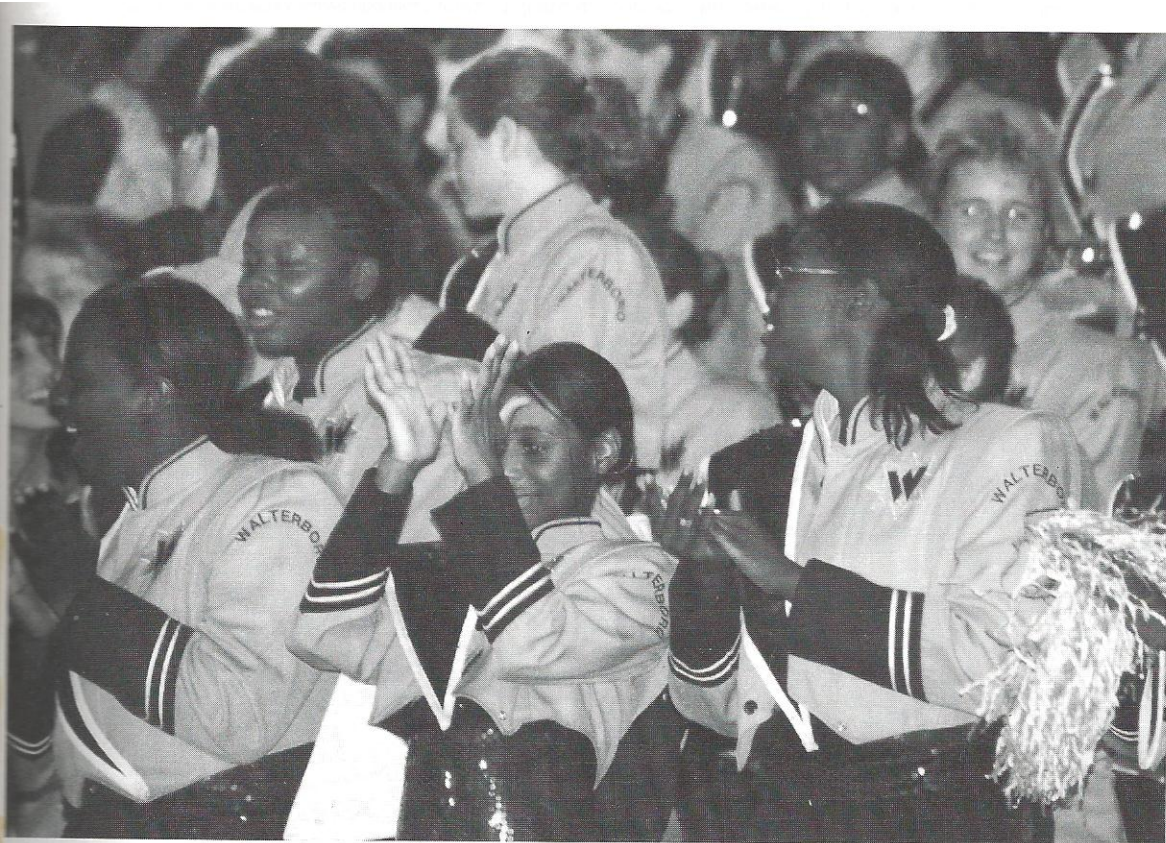
We got Spirit! The Band of Blue shows team spirit after a Friday night performance. The team was led to a victory with the support of these additional cheerleaders.