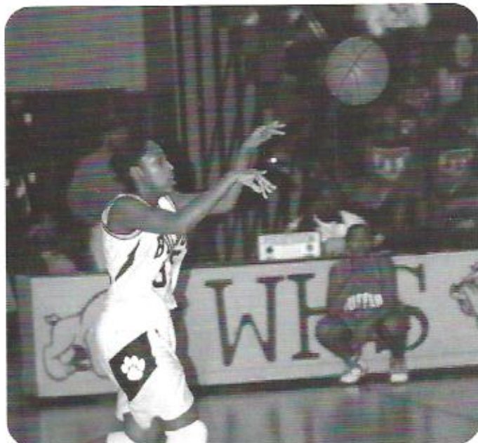
Varsity Girl's Basketball