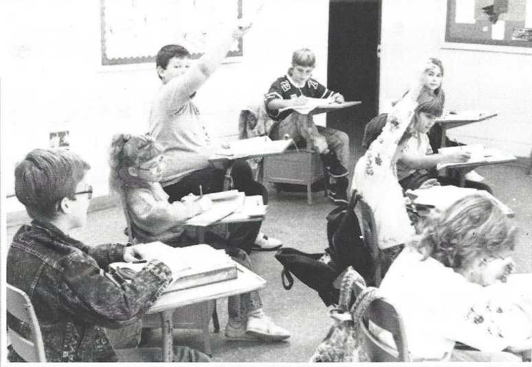
Most of the Fifth graders listen intently.