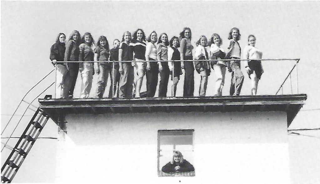
YEARBOOK STAFF 2000