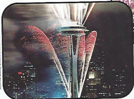
⦿ Space Needle Seattle, Washington