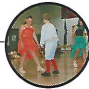
The traditional May Pole Dance.