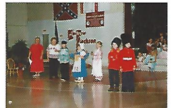
Students enjoy entertaining the spectators at the annual event.