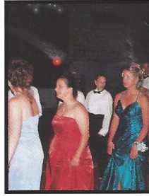
Cherishing the moment