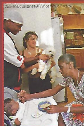
Homes across the country are opened to families left homeless in the wake of Hurricane Katrina.