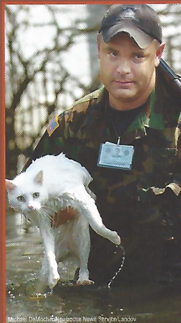
Many animals left behind during evacuation are rescued and given shelter or reunited with their owners.