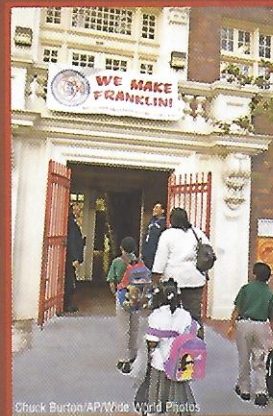
Three months after Katrina strikes, the first New Orleans public school reopens on November 28.