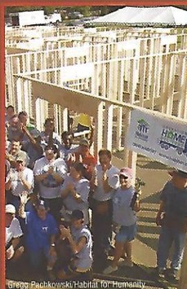
Thousands of volunteers help Habitat for Humanity rebuild homes in Louisiana, Mississippi and Alabama.