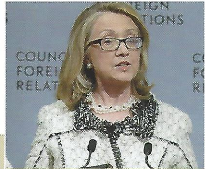
COUNCIL on FOREIGN RELATIONS