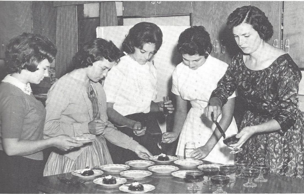
Attractively prepared food and correct serving make a meal more appetizing.