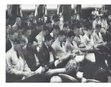
"We get to sing Christmas Carols."

"We gave the orphan's a Christmas party."