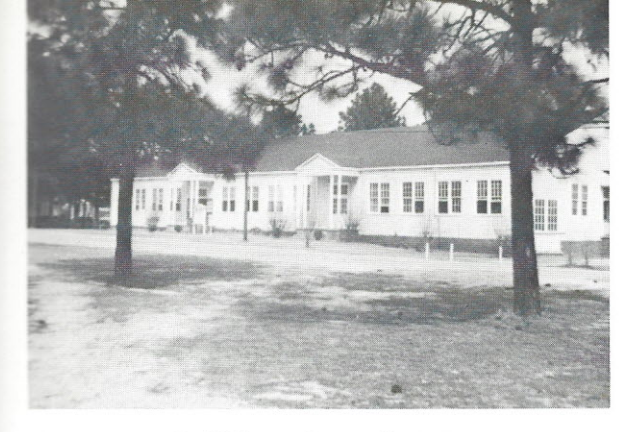
"Classroom building after school."