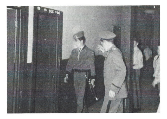
"Don't blow the Bugle, yet."