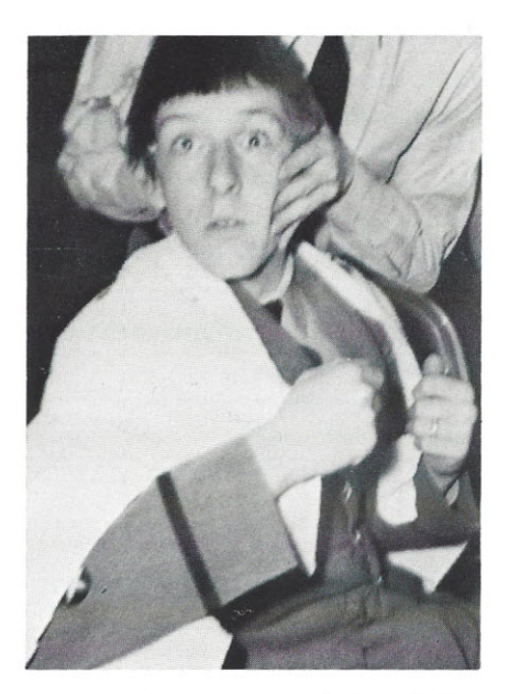
"Please don't cut my hair, sir."