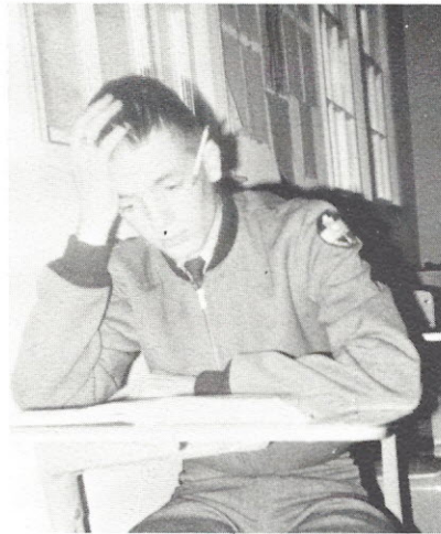
Who said high school was easy?