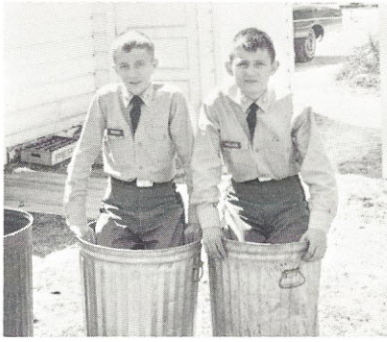
"Typical freshman hiding place."