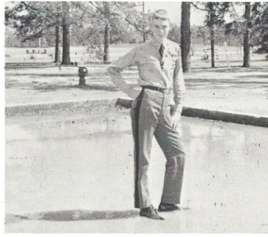
"Who says I can't walk on water?"