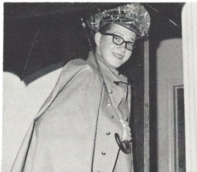
"Count Dracula strikes again."