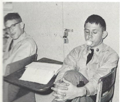
"The world is just a big bubble."