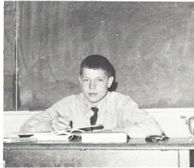
"But I want to teach the class."