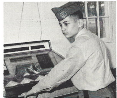
"Music soothes the savage beast."