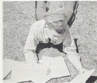
"These finals are killing me."